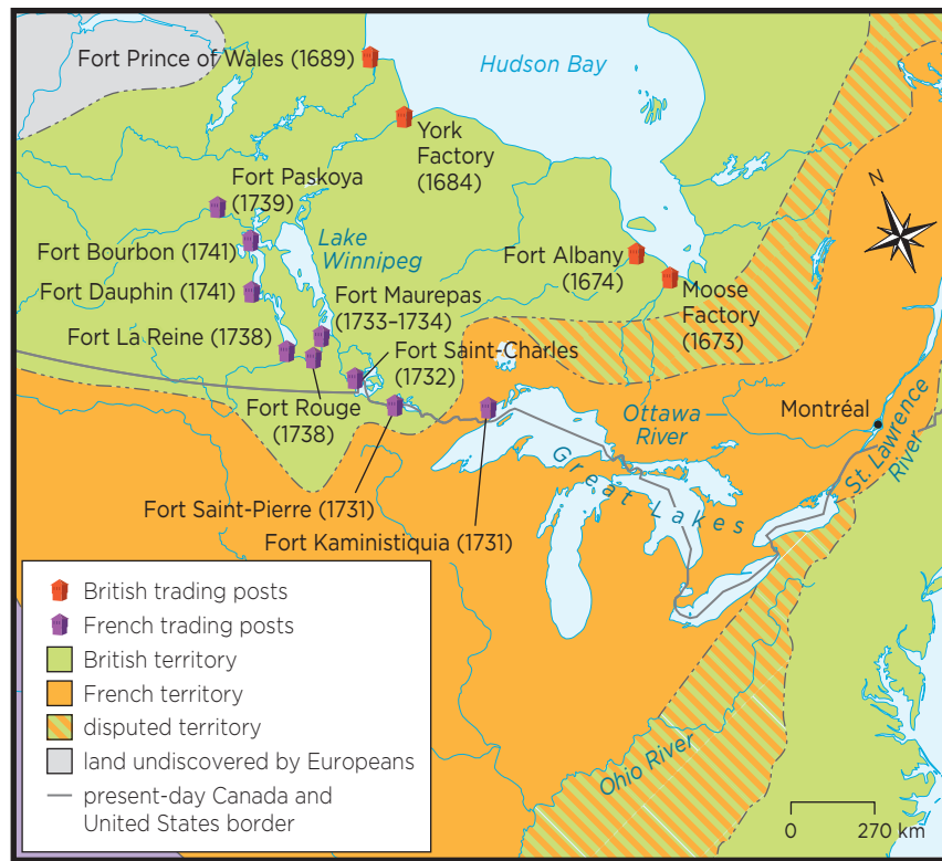
FIGURE 2.14 This map shows the established British trading posts and the French trading posts that were built by 1741 to compete with the British. Analyze: What do the years the forts were built tell you about French and British actions after 1713?